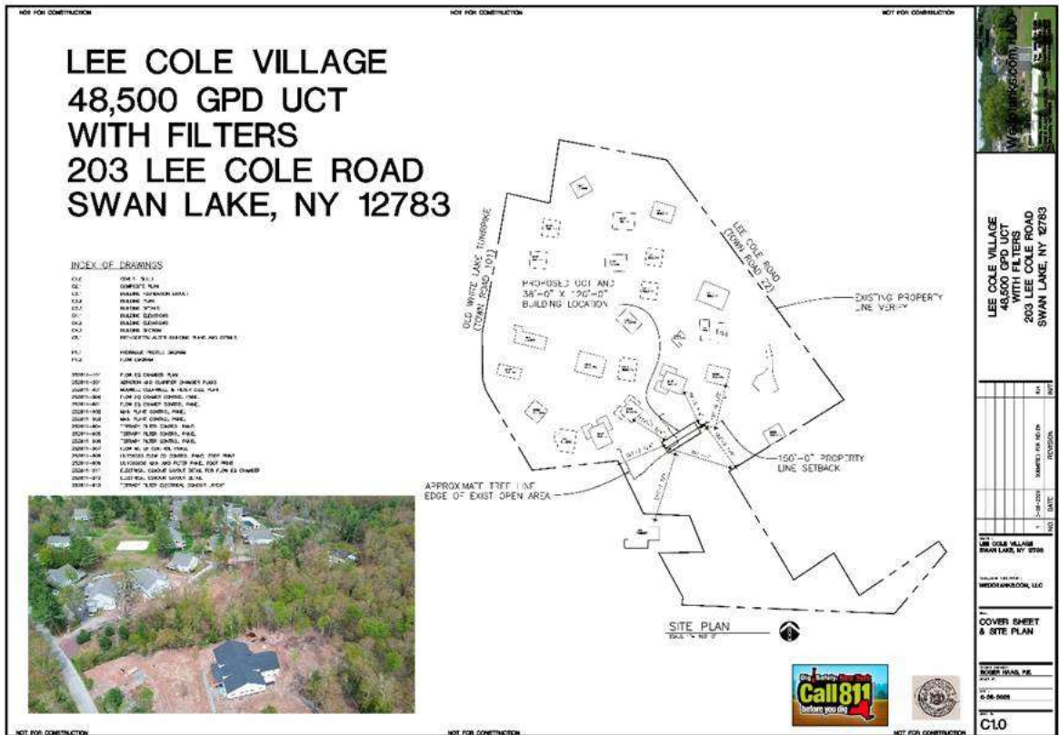
Figure 2. [Site Plan]