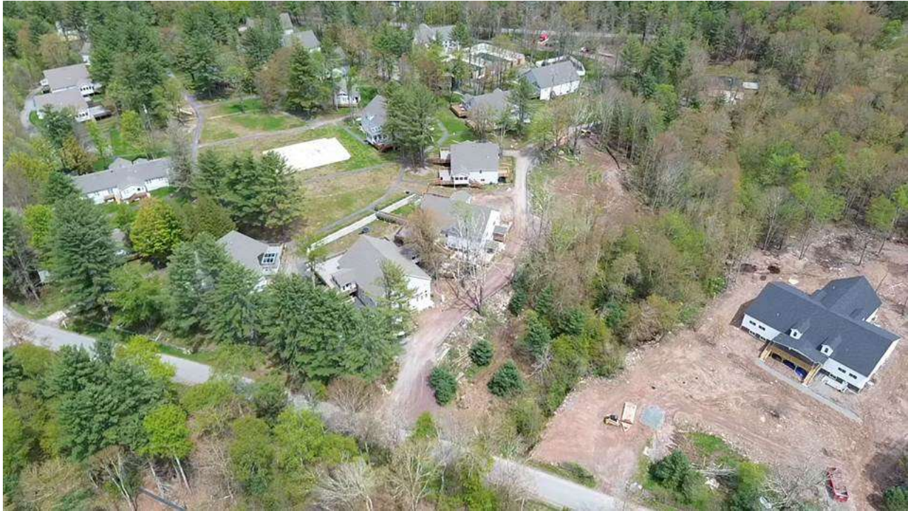
Figure 3. Outreach Radius Map